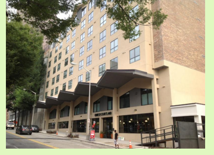
One Courtland Street student housing

This $61 million student high-rise apartment project was financed with DAFC issued bonds and will create 200 construction jobs and 30 permanent jobs stemming from the student housing development and 3,000 square-feet of retail and restaurant space that will occupy the ground floor.